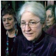
Sarah Sheppard Foundation, Ethos & Inclusion